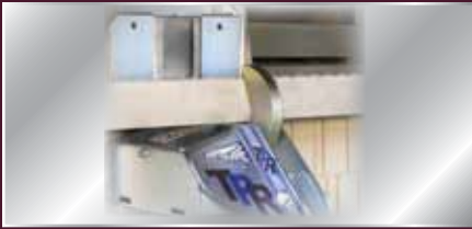
TPR™ is wall mounted away from dirt and debris on drive.