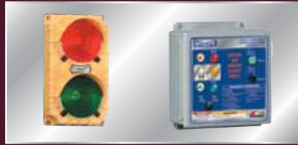
Controls are easily combined with dock leveler controls to integrate entire dock system.