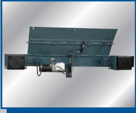
Hydraulic Edge-of-Dock Levelers