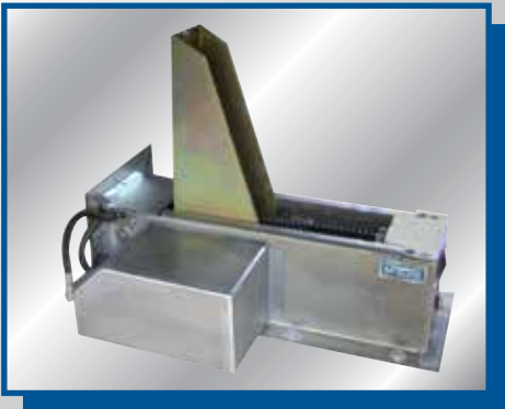
Hold-Tite® Vehicle Restraints

In conjunction with our parent company, Systems Incorporated, our nationwide network of over 400 distributors can satisfy all your loading dock needs.