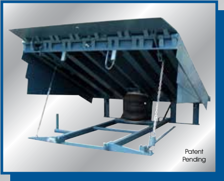
CentraAir® Air Powered Pit Levelers