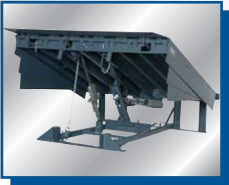
Mechanical Pit Levelers

McGuire is a division of Systems Incorporated located in Germantown, WI.