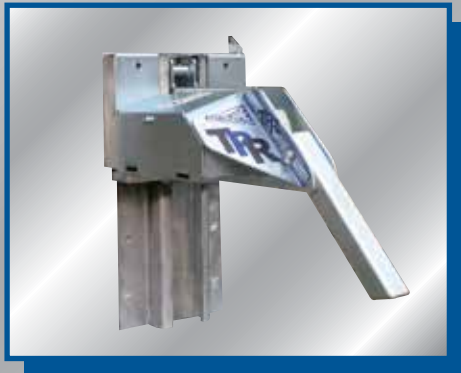
TPR® Vehicle Restraints