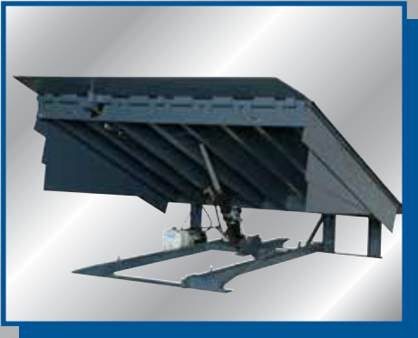
Hydraulic Pit Levelers

McGUIRE HAS BEEN THE LEADING ONE-SOURCE MANUFACTURER OF HIGH-QUALITY LOADING DOCK EQUIPMENT FOR OVER 40 YEARS.