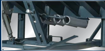
One point adjustable main spring assembly with roller and cam construction.