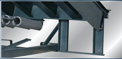
Full width rear hinge in compression with structural channel rear frame supports.