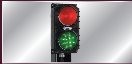
Exterior Lights - incandescent standard with optional LED for longer life.