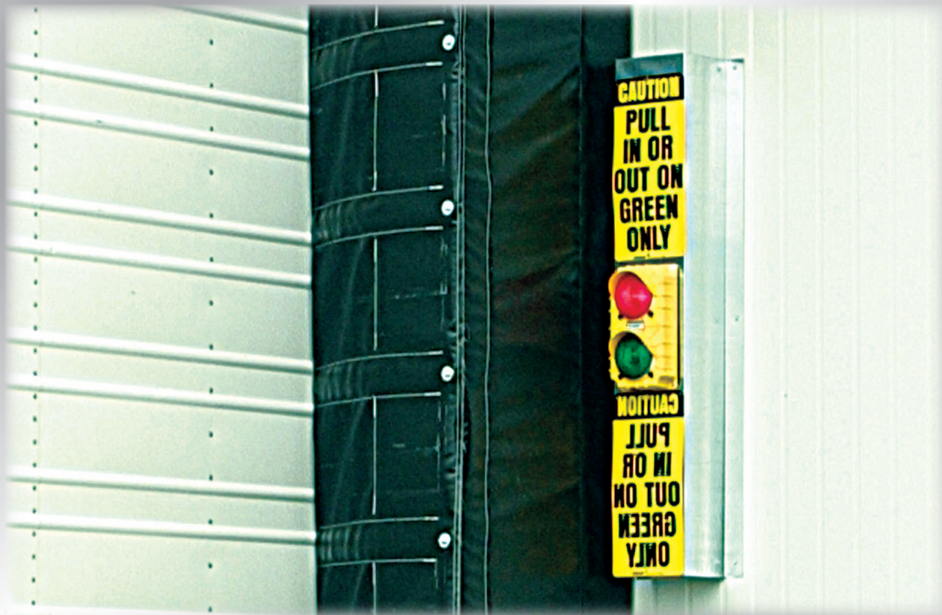
* Shown are lights and signs next to truck at dock