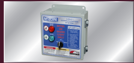
Light Communication System Control panel for automatic lights - manual light control panel similar.

The Light Communication Systems is a simple, reliable, and cost effective warning system that establishes a clear line of communication between truck drivers and dock personnel, thereby reducing the risk of accidents at the loading dock.