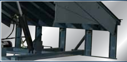
Full width rear hinge in compression with structural channel rear frame supports.