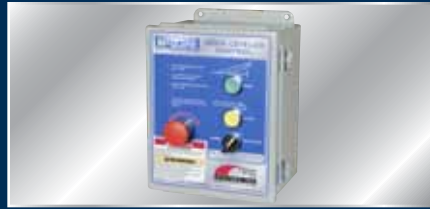
Optional full control panel with raise, lip out, emergency stop, and ARTD feature shown.