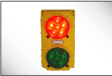
Exterior Lights - standard LED for longer life.