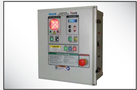
Upgrade to iDock Controls with optional integrated equipment for a more efficient loading dock.

The iDock™ Alert Light Communication System is an enhanced version of McGuire's simple Dock Alert and provides a reliable warning system that establishes a clear line of communication between truck drivers and dock personnel, thereby reducing the risk of accidents at the loading dock.