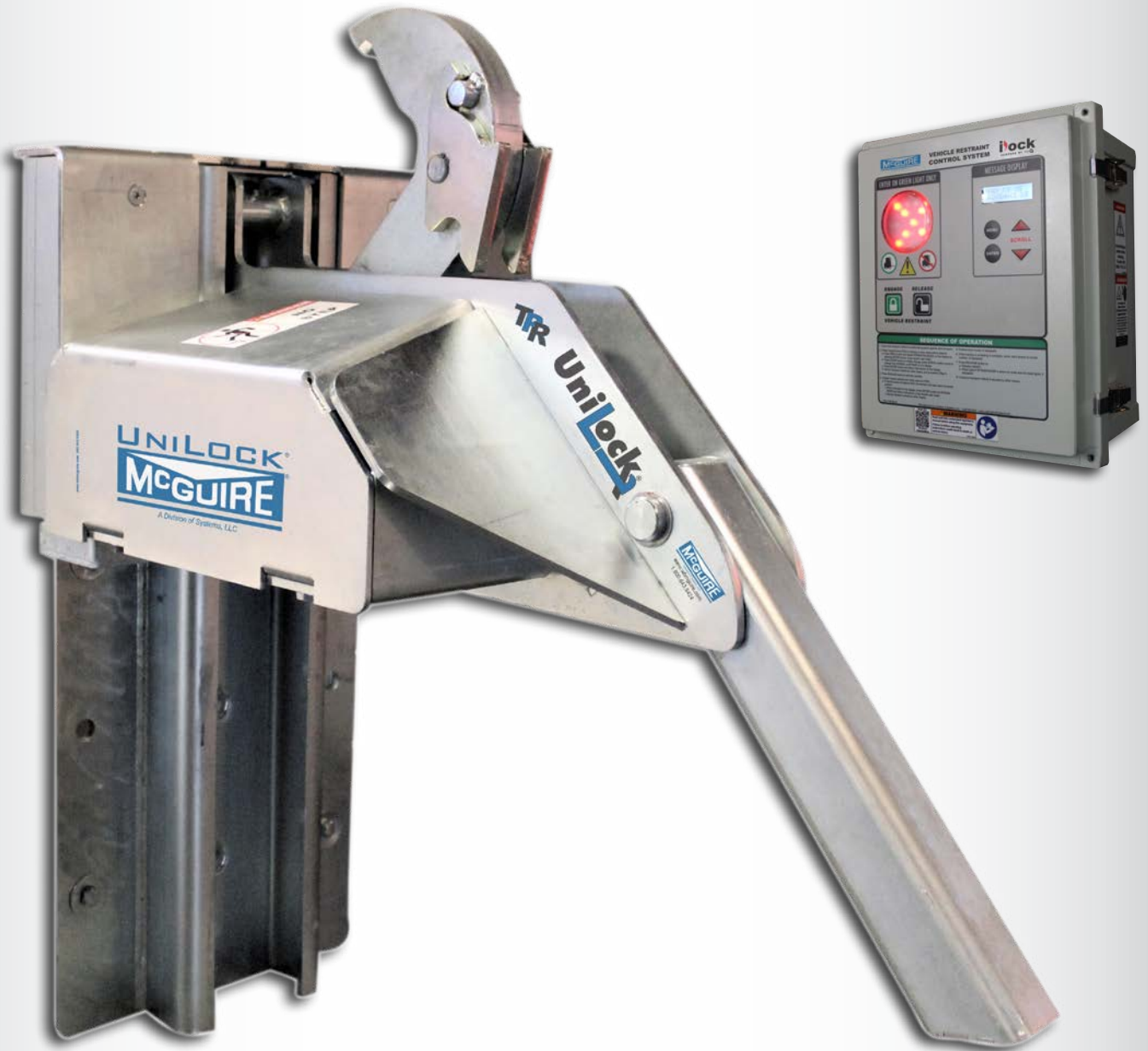
* UniLock® shown with advanced iDock® controls. Patent Pending.