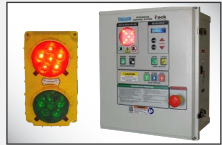
iDock® Controls includes light communication and can be integrated with other dock equipment.