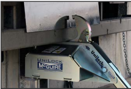
Locking mechanism maintains engagement even on intermodal trailers or an obstructed Rear Impact Guard (RIG).