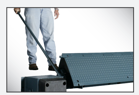
McGuire "Lift Free" lever action means no bending, lifting or pulling.