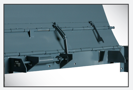
McGuire's exclusive four gusset support in stored position and end load position.