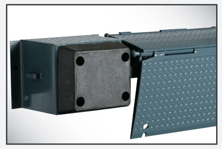
Bumper block assembly with safety tread plate-same as deck and lip.