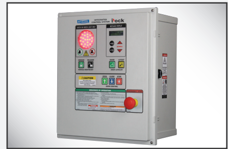
Optional iDock® Controls offer enhanced operation and an interactive message display with equipment information.