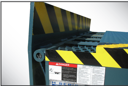
Custom order different paint designs to the Barrier Lip or leveler.