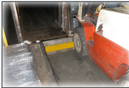
The barrier is designed to allow for end-loading at the loading dock.