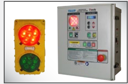
UniChock includes light communication and can be integrated with other dock equipment.