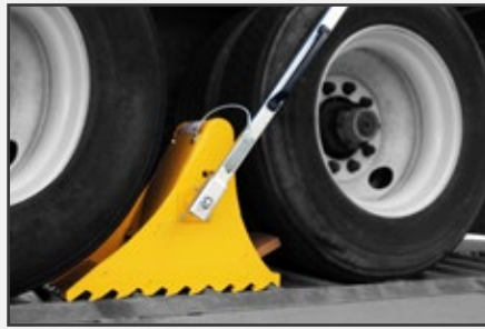
The chock system is installed with an articulated arm and ground plate to lock the chock in position.