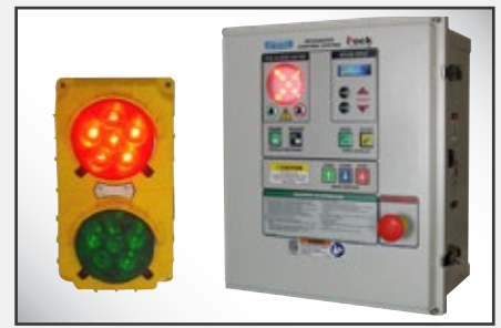
Includes light communication and can be integrated with other dock equipment in one controller.