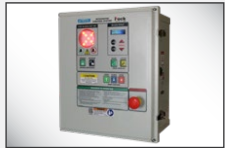
Optional iDock® Controls with online connection to myQ® Enterprise.