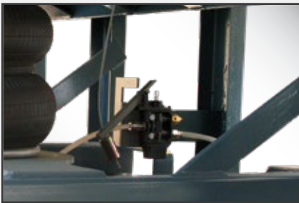
Quick connect fittings for simple installation.