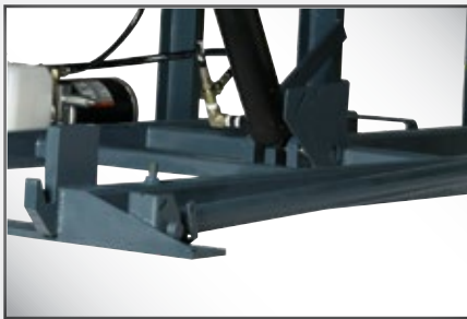
Dual port cylinders allow hydraulic fluid to travel in both directions for a regenerative system.