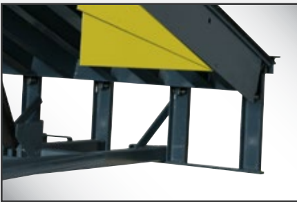
Full range sliding style toe guards for added safety.