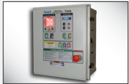
Optional iDock® Controls with online connection to myQ® Enterprise.