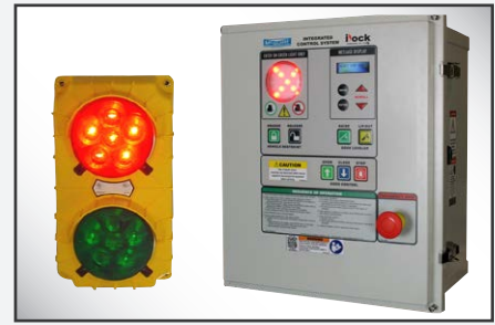
iDock® Controls includes light communication and can be integrated with other dock equipment.