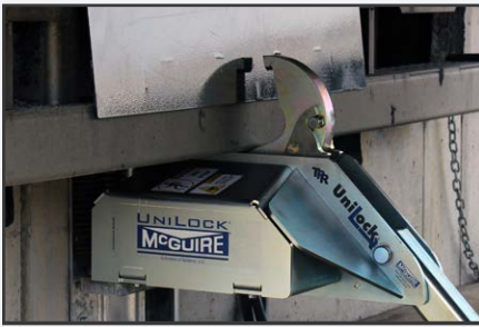
Locking mechanism maintains engagement even on intermodal trailers or an obstructed Rear Impact Guard (RIG).