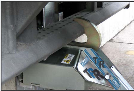
The TPR® hook rotates up to engage the RIG and secure the trailer to the loading dock.