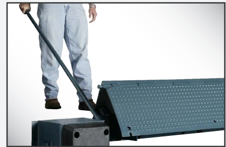
McGuire "Lift Free" lever action means no bending, lifting or pulling.