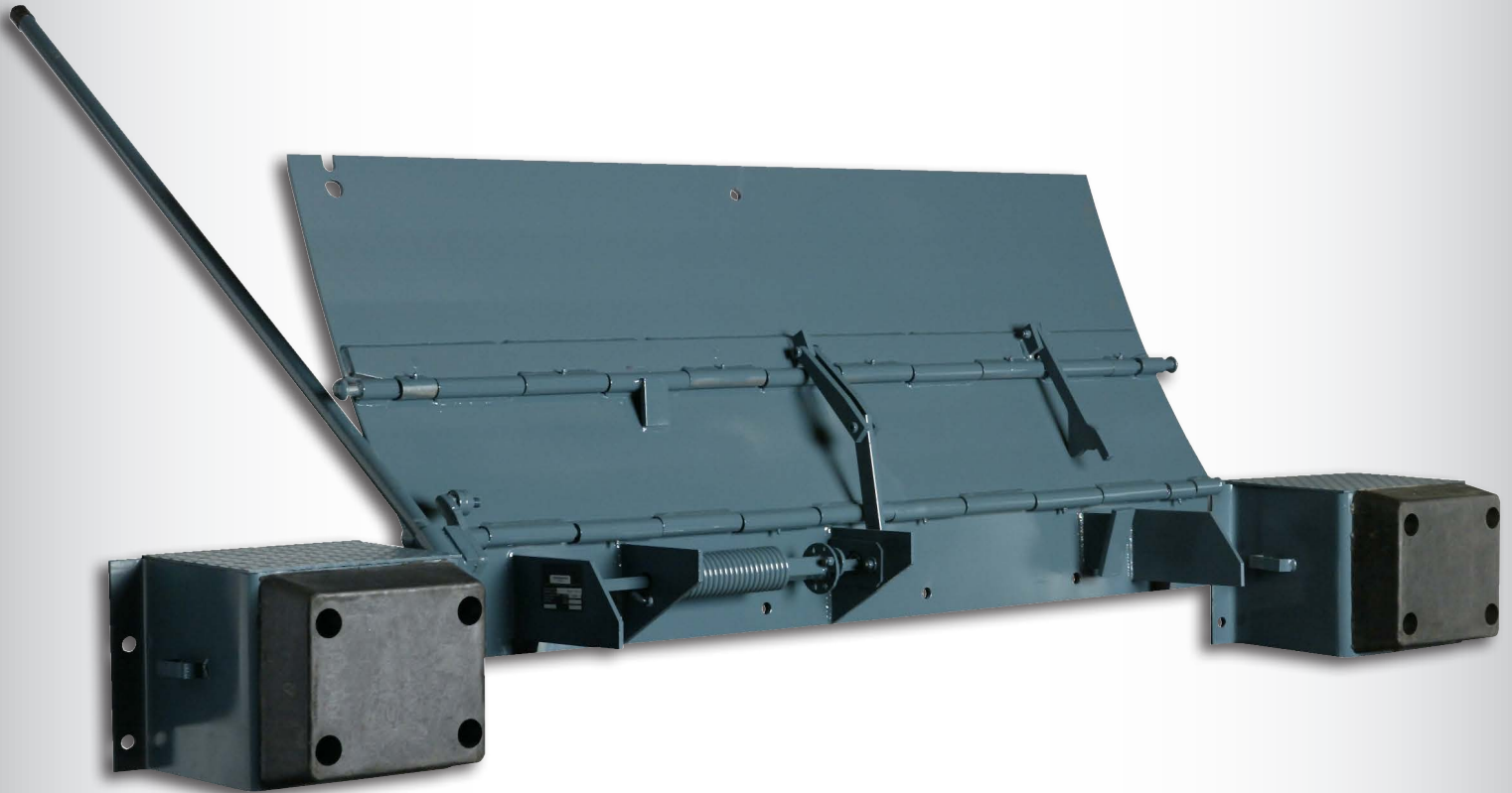
*MEDLF7220 shown with lift free lever operation and standard bumper block assembly