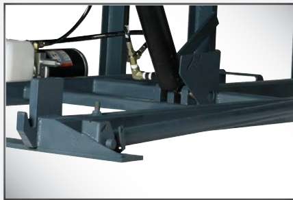
Dual port cylinders allow hydraulic fluid to travel in both directions for a regenerative system.