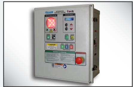
Optional iDock® Controls with online connection to myQ® Dock Management.