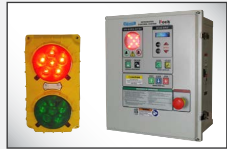
iDock® Controls includes light communication and can be integrated with other dock equipment.