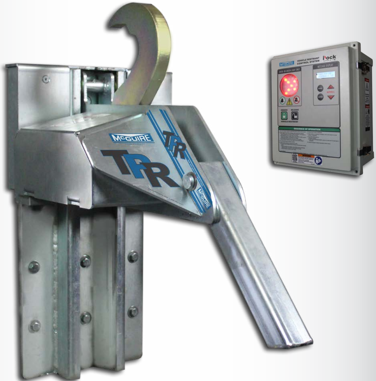
* TPR® shown with advanced iDock® controls.