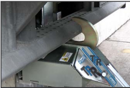
The TPR® hook rotates up to engage the RIG and secure the trailer to the loading dock.