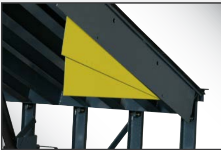
Full range sliding style toe guards for added safety.