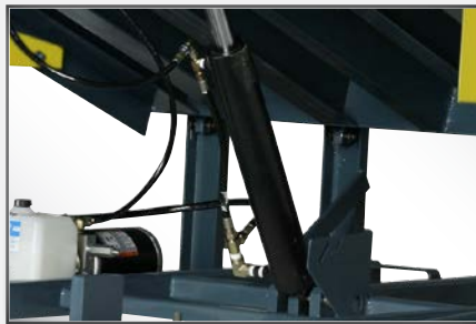
Dual port cylinders allow hydraulic fluid to travel in both directions for a regenerative system.