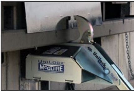
Locking mechanism maintains engagement even on intermodal trailers or an obstructed Rear Impact Guard (RIG).