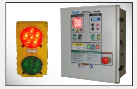
iDock® Controls includes light communication and can be integrated with other dock equipment.