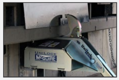
Locking mechanism maintains engagement even on intermodal trailers or an obstructed Rear Impact Guard (RIG).