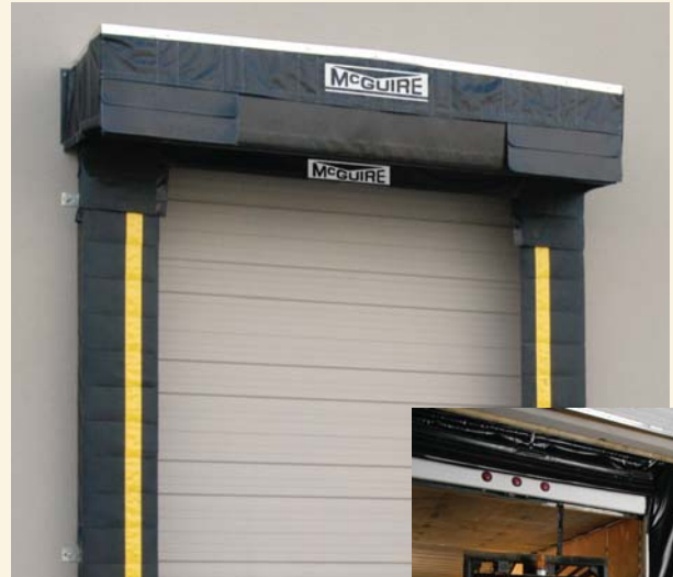
Weather Sentry™ head member shown is installed over an existing seal.

Options: • Head Pad assembly for use with existing seals or shelters • Additional projections • Tapered units