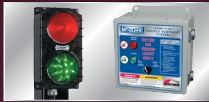
Optional light package and control panel with instructional decal for additional communication safety.