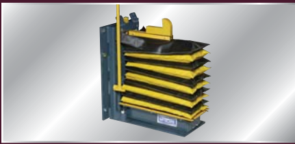
STOP-TITE® manually operated unit can be set and released easily from the dock with included operate handle.