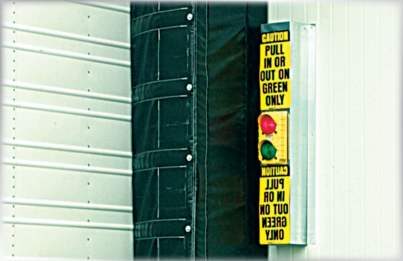
* Shown are lights and signs next to truck at dock