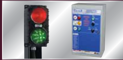
Controls are easily combined with dock leveler controls to integrate entire dock system.