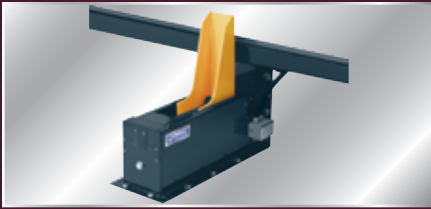
HOLD-TITE® can be drive mounted or wall mounted.