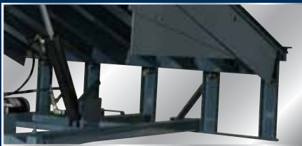
Full width rear hinge in compression with structural channel rear frame supports.