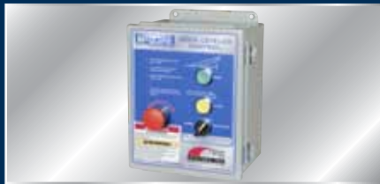
Optional full control panel with raise, lip out, emergency stop, and ARTD feature shown.